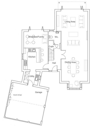
Plot 2 Ground Floor Plan